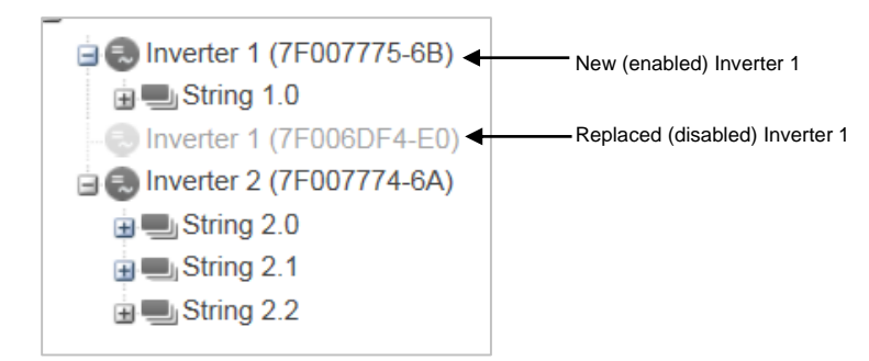
Figure 9: Example of system component list with a replaced inverter