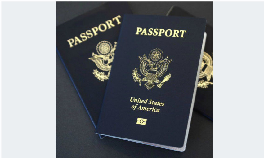
U.S. passports